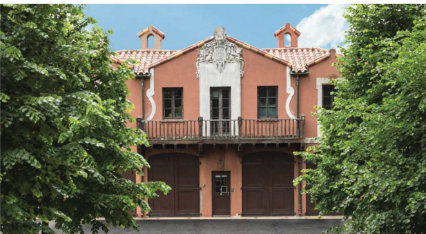
Carriage House/Learning Center